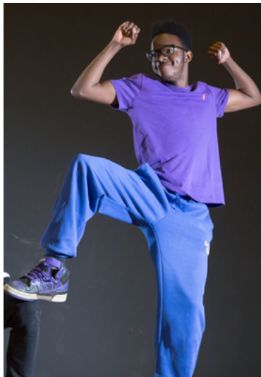
The Valley School